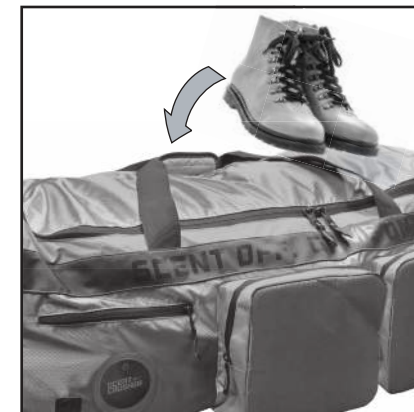
Put items to deodorize in the bag and zip the bag completely closed.

The Halo Generator will be housed in the pouch located on the side of the bag. Le générateur Halo sera logé dans la pochette située sur le côté du sac.