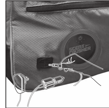
The wall outlet/car adapter can be used to power the Halo Generator.