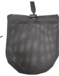
Mesh Bag Included Sac en filet Inclus